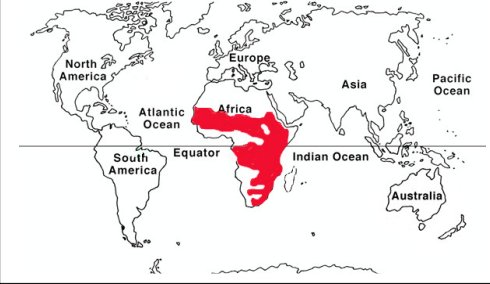
Native Range Map

Kingdom: Animalia Phylum: Chordata Subphylum: Vertebrata Class: Mammalia Order: Primata Family: Cercopithecidae Genus: Chlorocebus Species: aethiops